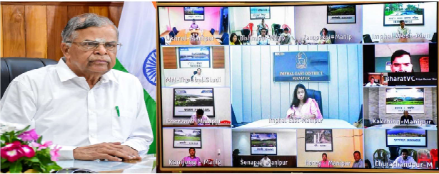
IT News Imphal, Sept 21:

Governor of Manipur & West Bengal, La. Ganesan today virtually interacted with all the Deputy Commissioners (DCs) of Manipur. During the interaction, Governor enquired about law & order situations and other major issues in all the districts.