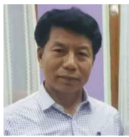
By: N. Munal Meitei

The 21st September is the International Day of Peace since 1981 with this year's theme, 'End Racism. Build Peace'. This day dedicates to strengthen the ideals of peace through non-violence and cease-fire. The United Nations also wants to address against the hate speech and violence directed at racial minorities and to strengthen the peace around the world.