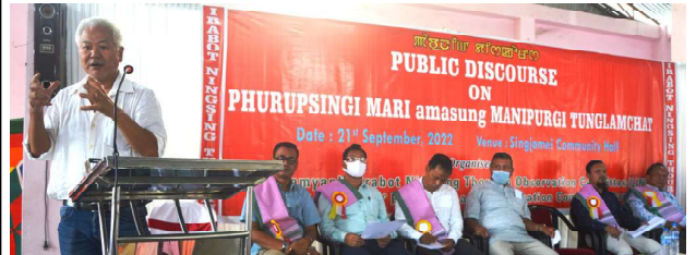
IT News Imphal, Sept 21:

The Lamyamba Irabot Ningsing Thouram observation committee (LINTOC) observed Lamyamba Irabot Ningsing thouram at the theme “Phurupshing mari amasung manipurigi tungchamchhat” under the aegis of the Protection and Preservation Committee (PPCM) at Singjam community hall.